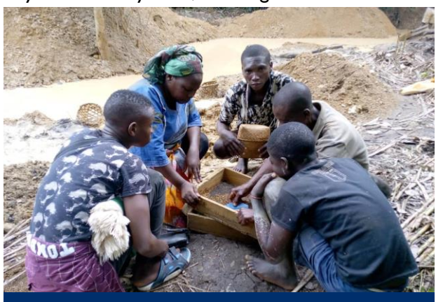
Photo 7: A woman beneficiary of AMPR SMARTER mining training in Boda washes gravel using a sieve.

Results: This quarter, a woman beneficiary of AMPR's SMARTER mining training in the Boda KP-compliant zone expanded mining activities in her site, applying the mining techniques she had learned. Using the SMARTER mining kit AMPR had provided, the woman trained artisanal miners working in her site on how to wash gravel using a sieve to improve the recovery of minerals. This transfer of improved mining practices is intended to enhance production and revenue in furtherance of broad-based social and economic inclusion of both women and men artisanal miners.