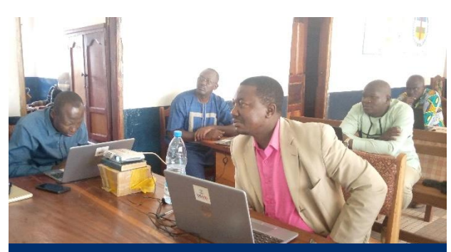
Photo I: MMG regional officers participating in a review workshop in Berberati.

capture of, and reporting on, purchase and sales data to reduce anomalies. During a technical review workshop in Berberati, the MMG regional officers conveyed that the mechanism had helped them rapidly analyze and detect anomalies, such as collectors who often declare fewer purchases than the quantity of minerals traced through their compiled purchase slip data. Also, the timely data analysis has enabled the regional officers to identify collectors who use their alias to make transactions. AMPR used this review feedback to compile a standard operating procedure (SOP) on enhancing the MMG monitoring mechanism for the production and marketing data as part of the closeout of this activity.