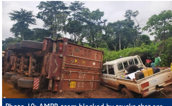
Photo IO: AMPR team blocked by trucks that are stuck along the Boda-Mbaiki road following heavy rains.

Security Incident: On the night of June 5, suspected armed elements of the Coalitions of Patriots for Change (CPC) attacked a base of the Forces Armées Centrafricaines (FACA) and the allied forces in the