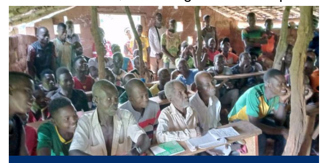
Photo 3: Artisanal miners in the pilot ZEA of Dinga undertaking theoretical training on SMARTER Mining.

ZEA in the Carnot subprefecture. The AMPR–MMG team conducted theoretical training on effective techniques for prospecting, mining, and rehabilitating exploited sites using Rehabilitation Generating Post-Mining Income interventions. The team also conducted practical training with the artisanal miners on the same techniques. The training received very positive feedback, resulting in increased MMG interest in determining how its technical staff, in partnership with AMPR, can support artisanal mining formalization in southwestern CAR.