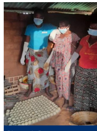
Photo 6: Bossoui women undertaking soapmaking.

Results: The Bossoui Women's Association, a beneficiary of AMPR livelihoods support in Boda, has expanded and sustained the village savings and loan association (VSLA). Following AMPR's theoretical training and practical techniques on VSLAs in October 2022, the group saved XAF 2,345,600, of which the group has saved XAF 325,300 in cash as a solidarity fund, with the rest for use as credit by the 30 members (of which six are men). However, the group's soapmaking livelihood activities have been paralyzed by a doubling in raw material prices due to increased transport