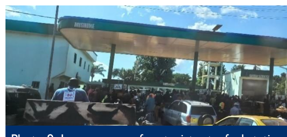
Photo 9: Long queues of motorists at a fuel station in Bangui.

this agreement, Octogone will start supplying fuel to the CAR market to address the ongoing fuel crisis. During this quarter, AMPR explored means of buying and stocking about 1,000 liters of diesel, which was relatively available from the fuel stations. As a mitigation measure, AMPR reduced the use of gas vehicles for project activities and resorted entirely to diesel vehicles.