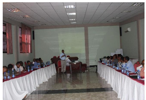
Training on the Newly Approved Proclamation No. 1161/2019 and Draft Valuation Regulation to Federal and Regional GoE Staff

land tenure and property rights and improve livelihoods. Under its Land Administration to Nurture Development (LAND) project, it supported the GoE with evidence-based research and learning opportunities to assess implementation of its land laws. The GoE recognized that expropriation and compensation legislation was not consistently and effectively implemented due to a lack of an implementation regulation containing clearly defined valuation methodologies and procedures. With LAND support, the GoE substantially revised its legislation and produced a draft version of the Federal Expropriation, Valuation, Compensation and Resettlement Proclamation No.1161/2019.