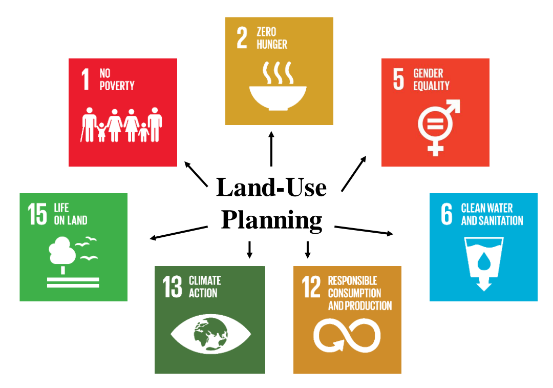
Figure 1. How effective, affordable, and socially just land use planning can positively contribute to the 2030 SDGs.

However, land use planning that is effective, affordable, and socially just can have significant positive impacts on both people and the environment. For example, land use planning can positively contribute to many of the SDGs (United Nations 2015) as illustrated in Figure 1. Land use planning efforts have the potential to increase agricultural productivity, food security, and incomes of smallholder farmers. Through securing equal access to land for both men and women, land use planning can contribute to gender equality globally. Land use planning efforts can protect critical ecosystem services, such as clean water, and promote awareness of sustainable development that matches the potential of the land. Further, land use planning that matches appropriate land-uses with suitable land can strengthen the resilience of people and the environment to climate-related hazards, as well as contribute to a land-degradation neutral