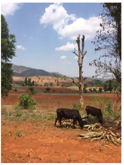
Cattle grazing in Let Maung Kway Village Tract

tamarind in the market. The rice is for their own consumption; given that rice is grown on a rotational fallow basis, they have to buy rice (golden rice from Bagan) to meet their household food needs. Besides growing crops on their taungya land, they also have small home gardens for household vegetable production such as French beans, long beans, mangoes, bananas, and oranges.