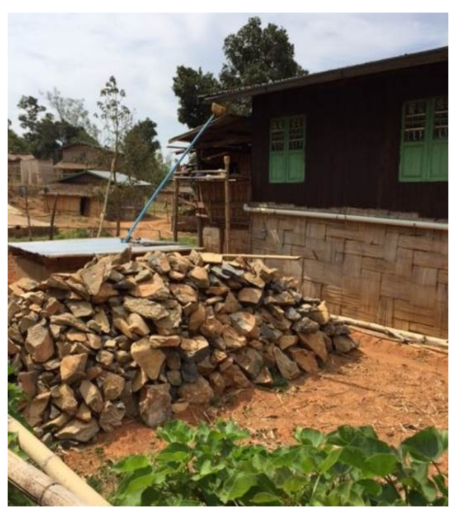
Cut firewood in Let Maung Kway Village Tract

Each of the villages has a small community forestry area nearby; these were established in 2004. Under MONREC's management, they are about 20-60 acres to each village which provides firewood in an attempt to support better overall forest conservation. Formal agreements for community forestry certificates (30-year term) were established with MONREC (then known as MOECAF) in 2006. However, the community forest areas in the smaller villages were not provided by MONREC but by independent organizations. MONREC has