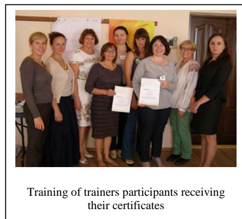
Training of trainers participants receiving their certificates

In August 2013 the Project conducted the selection of trainers and executed the training for trainers under a grant to the Ukrainian Women Fund. The two-day training for trainers was conducted in Kyiv and joined trainers from different regions of Ukraine. The main topics covered during the training session were gender and its place in everyday life of rural communities, how to reveal gender issues during trainings in socioeconomic ways and demonstrate its impact on life in the community, legal provisions on ensuring gender equality in Ukraine, and many others. The selection of trainers was based on the principle of differentiation – select people from