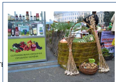
Fifth All-Ukrainian Organic Products Fair, September 7, 2013, Kyiv