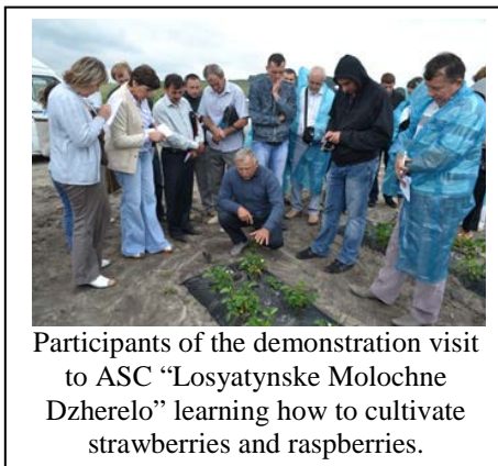
Participants of the demonstration visit to ASC "Losyatynske Molochne Dzherelo" learning how to cultivate strawberries and raspberries.

Included as part of these loan products are supportive materials such as recommendations for key lending terms, a set of templates (credit agreement, collateral, guarantees, etc.), and information about the relevant types of agricultural production to help assess the creditworthiness of potential loan recipients. Also at the meeting, methodological recommendations for managing credit portfolios within the credit unions were presented and passed for implementation in the credit unions that are specializing in lending to SMPs and have the intention to enhance their financial sustainability and improve the quality of its services. These documents include recommendations for credit unions on how to (i) manage credit union's assets and liabilities and SMP-loan portfolio; (ii) administer lending and deposit operations; and (iii) disseminate information about loan offers of credit unions among their customers. The event was attended by representatives of 10 credit unions from the Southern and Central regions of Ukraine.