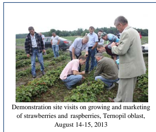
Demonstration site visits on growing and marketing of strawberries and raspberries, Ternopil oblast, August 14-15, 2013