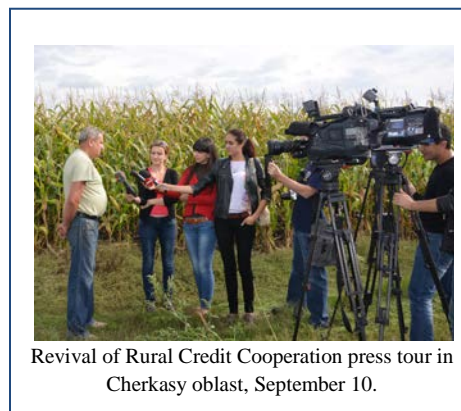
Revival of Rural Credit Cooperation press tour in Cherkassy oblast, September 10.

The trip to Cherkassy oblast started with a press-conference at which experts informed participants about the activities of credit unions, rural credit cooperation and amendments that need to be implemented in the legislation on credit unions in order for them to unleash their potential of ensuring access to funding for small and medium producers. Journalists had the opportunity to visit farmers who secured lending from the "Kreditsoyuz" and learn about the results of this cooperation.