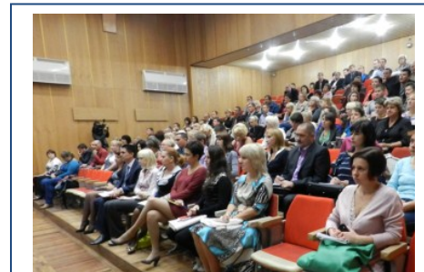
Training for state registrars conducted by the Land Rights Resource Center, Kherson, September 6, 2013

One of the major activities of the Land Rights Resource Center this quarter was the continuation of the large-scale training campaign for state registrars and notaries entitled “State Registration of Land Plots and Rights to Land Plots; Authority of Local Governments with Regard to Land Management.” In 2013, a new State Registration Service was established in Ukraine tasked with undertaking the state registration of title to real estate, including land. In addition to state registrars, notaries are now procedurally required to be engaged in the registration of the title to real estate. Both state registrars and notaries required additional training so as to better understand the specifics of land issues, know how the cadastre system functions, and understand the newly implemented registration procedures. Also, local authorities at the raion and village levels, who are primary contact points of rural landowners needed to learn about the new procedures. This series of trainings was designed to address these needs and was launched at request of the Ministry of Justice.