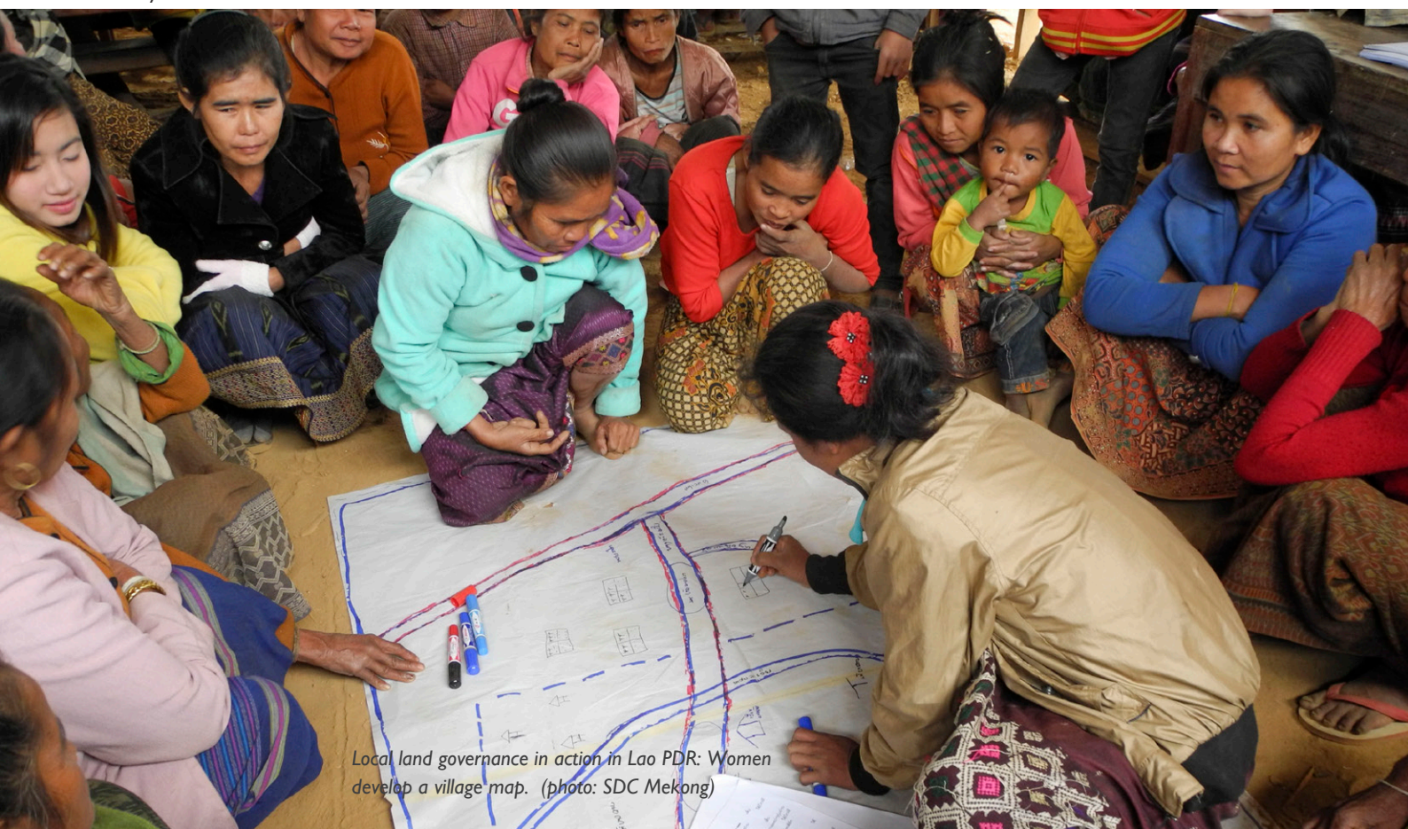
Local land governance in action in Lao PDR: Women develop a village map.

The Voluntary Guidelines on the Responsible Governance of Tenure of Land, Fisheries, and Forests in the Context of