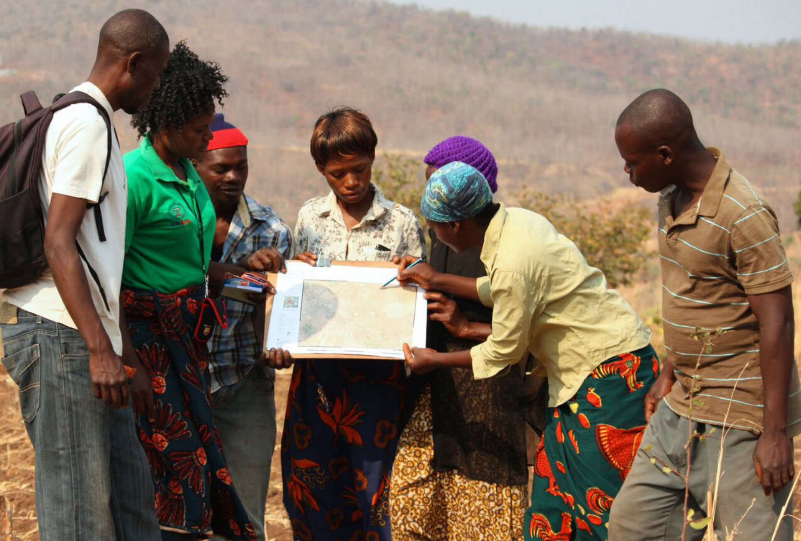
Community members of Faisako Village in Zambia's Maguya Chiefdom discuss field demarcations during community agricultural parcel mapping.